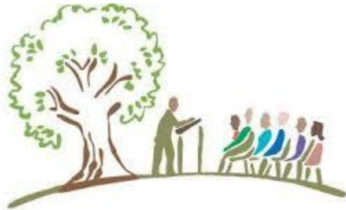
Outdoor Worship Service

The Church Council has resolved that it would be good to restore our practice of passing the collection plate as this is an important piece of our total act of worship.